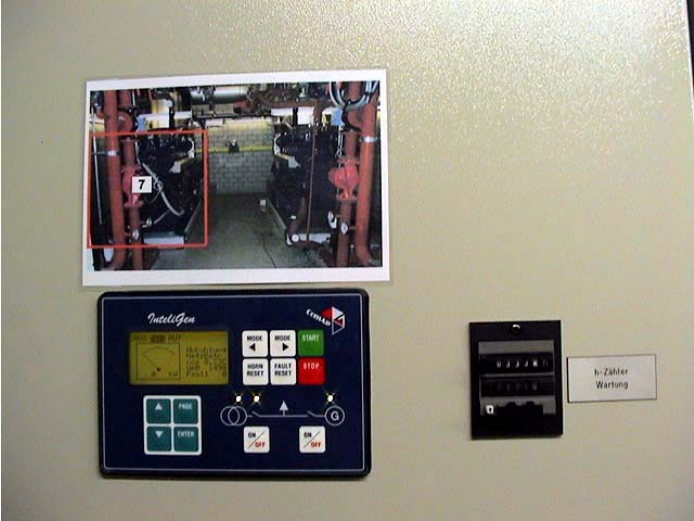
Front panel with IntelliGen dual fuel application, special software branch