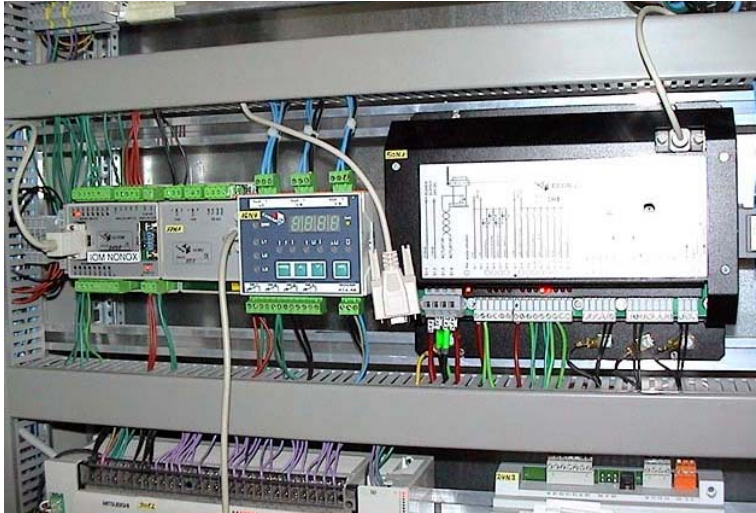
Control panel including I/O extension module, multiplexer unit for remote control, vector shift relay and dual fuel governor