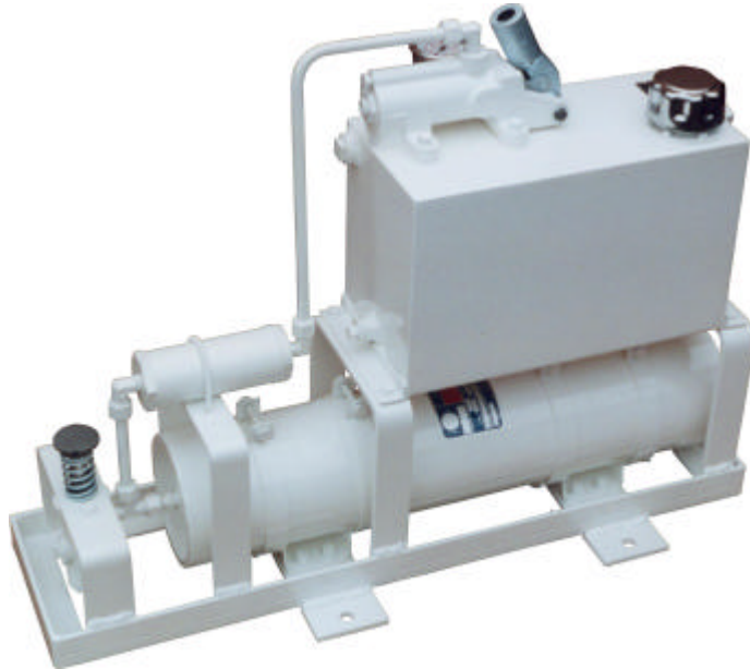
HPS starting system (Variation B) with all components mounted on a frame, fully piped and painted according to the specification of the customer.