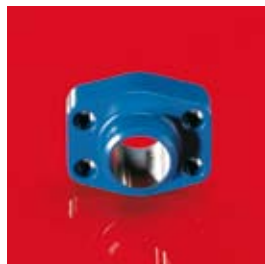
SAE - flanges