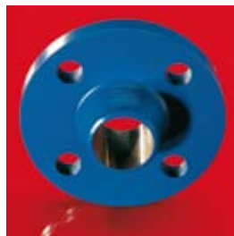
DIN - flanges ANSI - flanges JIS - flanges