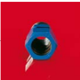
Pipe thread G Pipe thread NPT